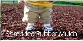
Shredded Rubber Mulch