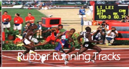
Rubber Running Tracks