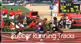
Rubber Running Tracks