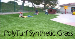
PolyTurf Synthetic Grass