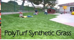
PolyTurf Synthetic Grass