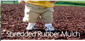
Shredded Rubber Mulch